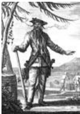
Edward Teach (aka Blackbeard, English, 1680-1718)