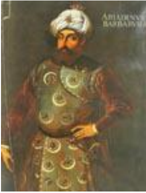
Hayreddin Barbarossa (Ottoman, 1478-1546)