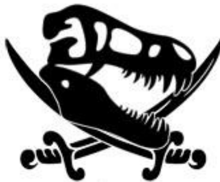
Cap'n Rex's Symbol