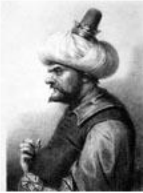
Oruç Reis (aka Redbeard, Ottoman, 1474-1518)