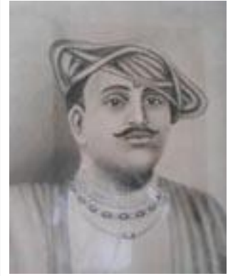
Kanhoji Angré (Indian, 1669-1729)