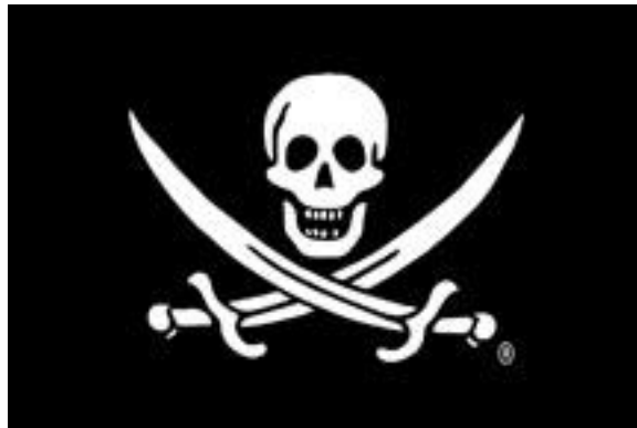
The Jolly Roger