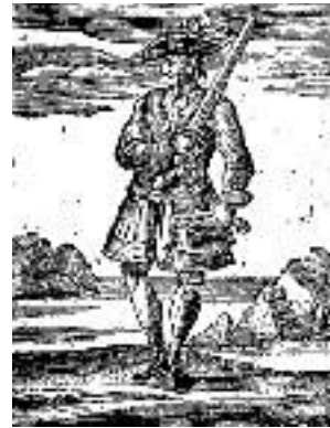
Robert Culliford (English, 1666-?)