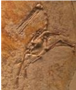
Terry ( Pterodactyl ) - https://en.wikipedia.org/wiki/Pterodactylus Photo from American Museum of Natural History by Meg Stewart