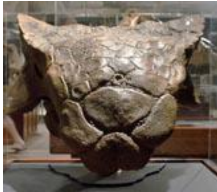
Kyle ( Ankylosaurus ) - https://en.wikipedia.org/wiki/Ankylosaurus Photo from Museum of the Rockies by Tim Evanson