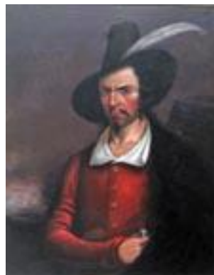
Jean Lafitte (French, 1780-1823, helped defend New Orleans in War of 1812)