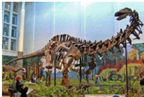
Pat ( Apatosaurus ) - https://en.wikipedia.org/wiki/Apatosaurus Photo from Carnegie Museum of Natural History by Tadek Kurpaski