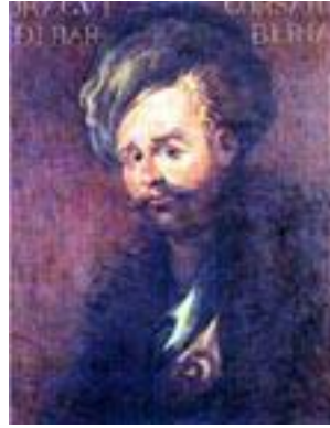
Turgut Reis (aka Dragut, Ottoman, 1485-1565)