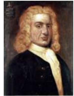
William Kidd (Scottish, 1654-1801)