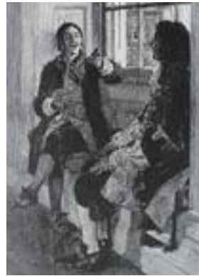
Thomas Tew (aka Rhode Island Pirate, English, ?-1695)