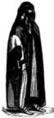
Rahmah al-Jalahimah (Arab, 1760-1826, wore an eye patch)