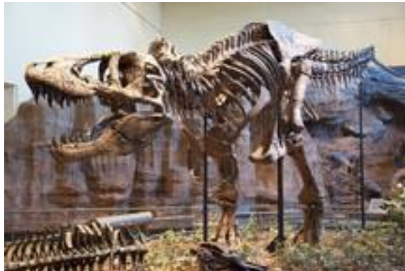
Rex ( Tyrannosaurus rex ) - https://en.wikipedia.org/wiki/Tyrannosaurus Photo from Carnegie Museum of Natural History by Scott Robert Anselmo

Cap'n Rex & His Clever Crew features four types of dinosaurs. I based their names on their genus.