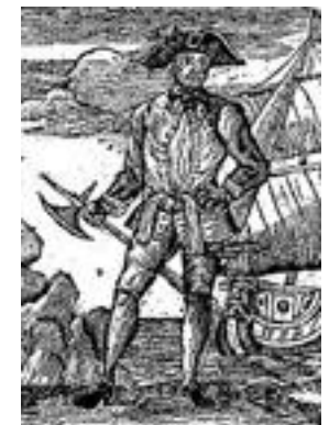
Edward England (Welsh, 1685-1721)